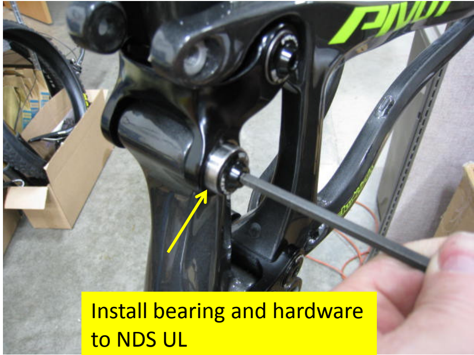
Install bearing and hardware to NDS UL